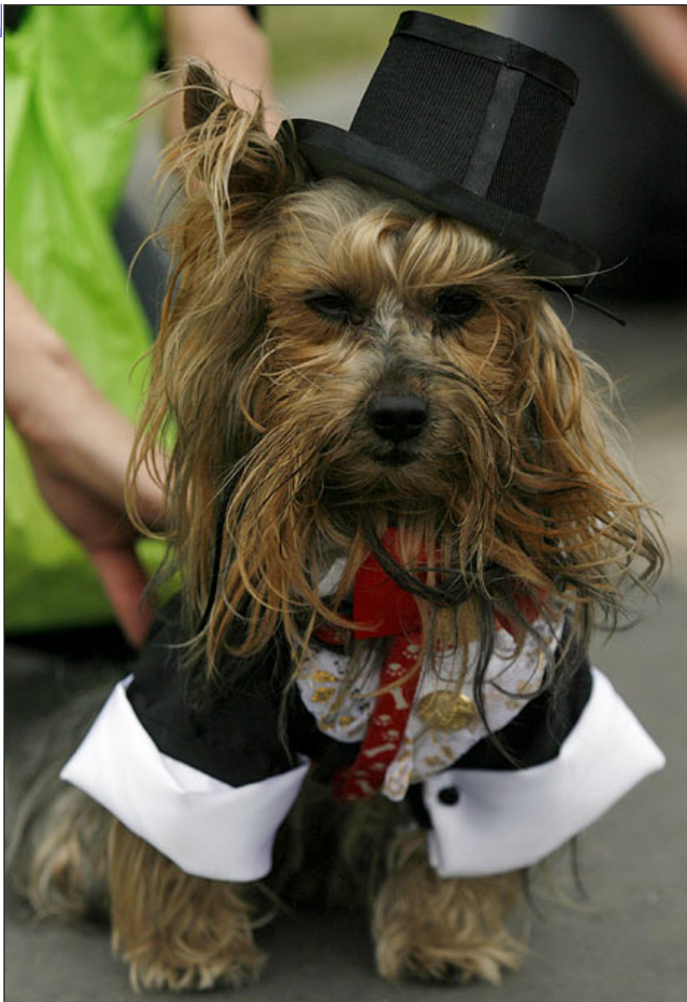
A doggy groom enjoying his big day

I'm A Celebrity... Get Me Out Of Here! star Gemma Atkinson has only been in the jungle for two weeks and she's already losing weight Jungle agony aunt Anna Ryder Richardson voted off I'm A Celebrity