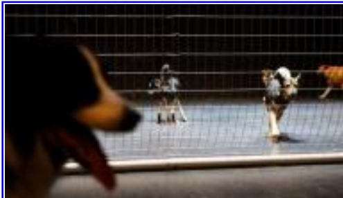
Dogs in the Zagreb theatre where they perform in the play "Timbuktu"