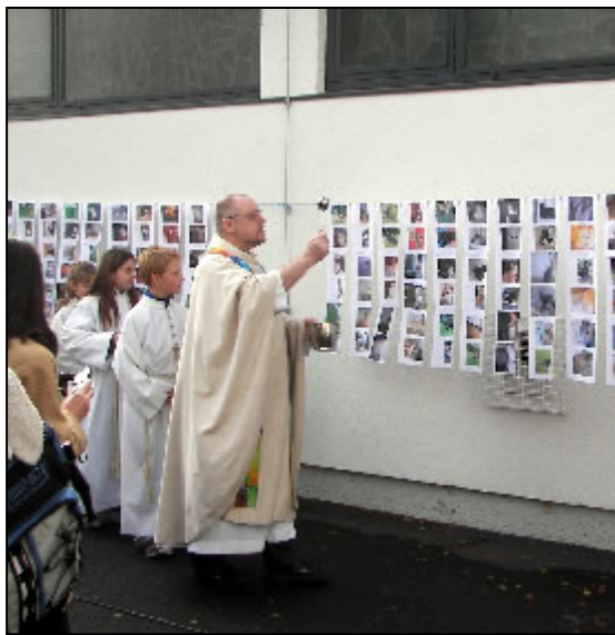
Animals including horses, donkeys, cats and dogs who could not be at the service were also blessed.

find exactly what you're looking for on Horsetalk Directory