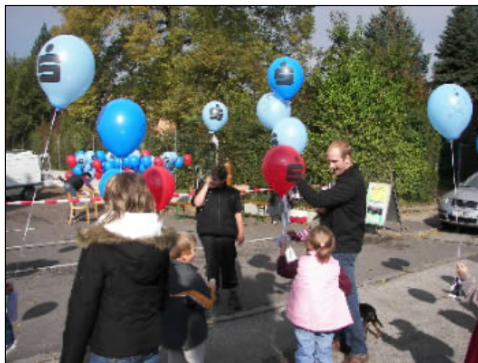
Children released dozens of balloons after the service.

After Holy Mass children sent balloons into the world with a call for a responsible and loving treatment of all of creation.