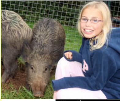
View video »

Got a news story for the site? Click here