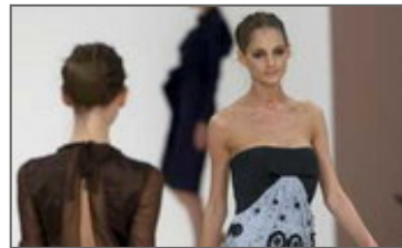
Valentino at Paris fashion week