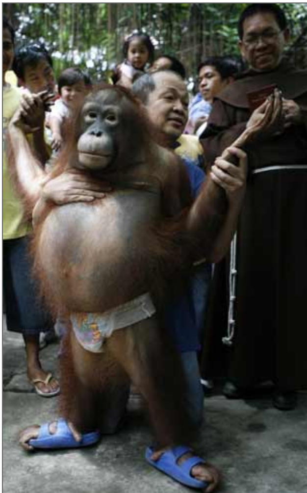
A man holds a diaper-wearing orangutan as a priest prays and blesses him during the World Animal Day in Malabon north of Manila October 4, 2008.