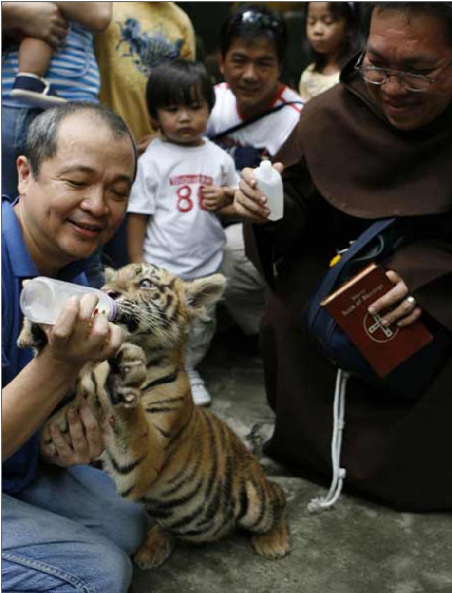
A priest sprinkles holy water on a baby Bengal tiger while a man feeds milk to it during World Animal Day in Malabon, north of Manila October 4, 2008.