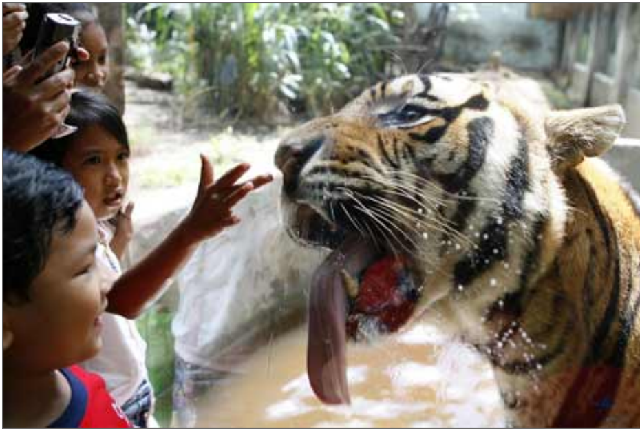
Children look at a Bengal tiger at a zoo during World Animal Day in Malabon north of Manila October 4, 2008.