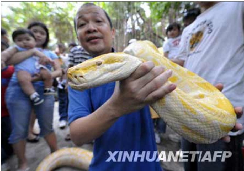
A man holds a boa during the World Animal Day in Malabon north of Manila October 4, 2008.

Children look at a Bengal tiger at a zoo during World Animal Day in Malabon north of Manila