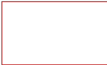
World Animal Day marked