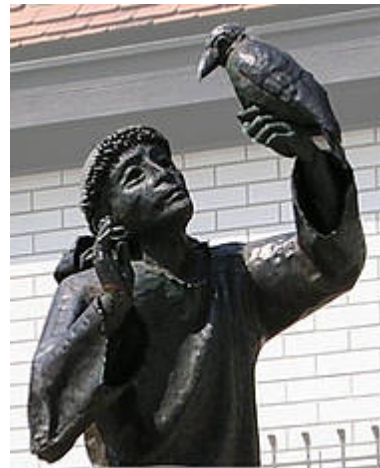
Statue of Saint Francis of Assisi in the well of the Academy for Animal Welfare.

Francis of Assisi - founder of the Franciscan Order and patron saint of animals - looked at the animal as a living creature of God and the brother of the man. But it is important that Francis of Assisi, the idea of unity of creation in the sense of equality of all before God and one another exemplified and tirelessly preached. Even the smallest worm, he regarded as God and therefore worthy of protection. Two years after his death on 3 October 1226, on 4 October 1228, he was canonized.