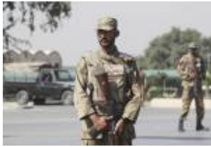
Taliban embarrass Pakistan army