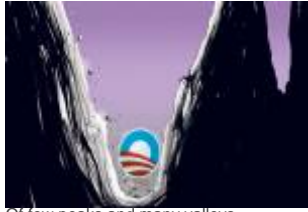
Of few peaks and many valleys