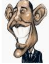
Obama is now world's leading spokesman