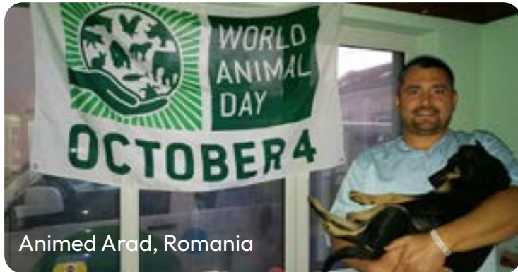
Animed Arad, Romania

(The flag is only available in English, but feel free to print your own from our logo translations .)