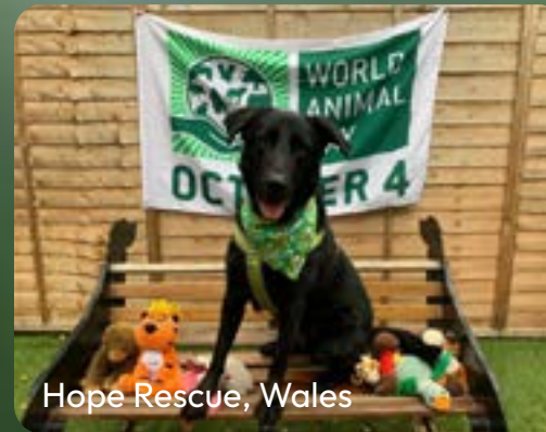
Hope Rescue, Wales

IF YOUR WORK INVOLVES REHOMING DOGS, TAKE SOME GREAT PHOTOS OF YOUR DOGS MODELLING THE BANDANAS FOR SOCIAL MEDIA!