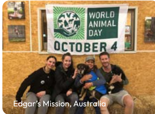
Edgar's Mission, Australia