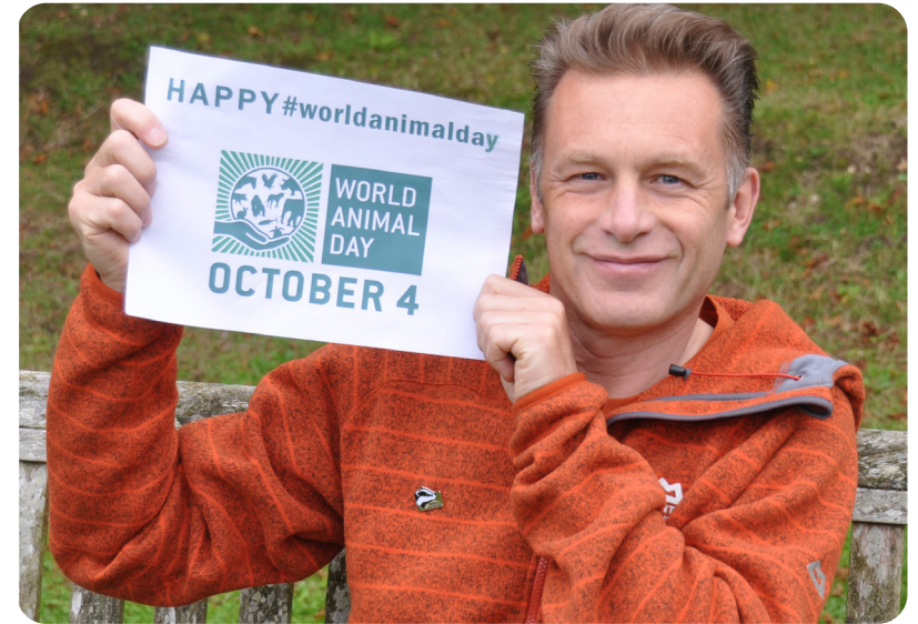
Above: English naturalist, nature photographer and television presenter, Chris Packham