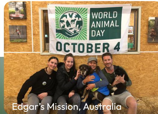
Edgar's Mission, Australia