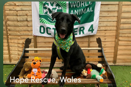
Hope Rescue, Wales

TAG US IN YOUR WORLD ANIMAL DAY PHOTOS AND WE'LL SHARE THEM ON OUR CHANNELS!